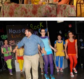
The Drama Squad made it to the state semi-finals with their performance of Rabbit Hole in March (above).